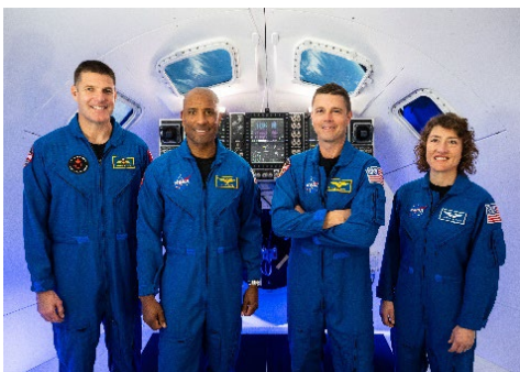
Crew of Artemis II

The Artemis I mission launched in 2022, and Artemis II is scheduled for late 2024. Artemis III is planned to take humans to the Moon, possibly in 2026! Artemis III will use Starship HLS to land on the Moon, and that spacecraft is still being developed.